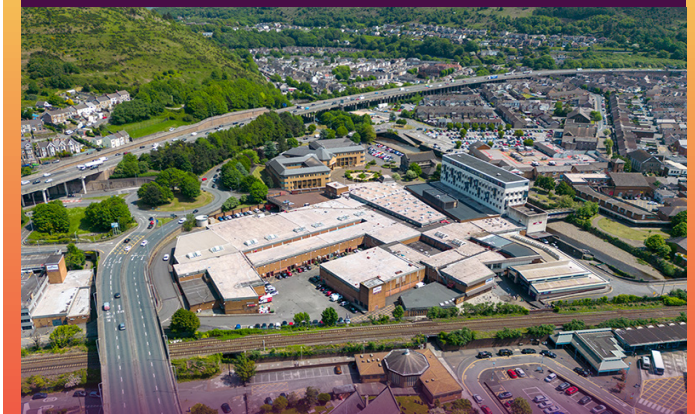
Aberafan Shopping Centre, Port Talbot SA13 1PB

18 mins from Port Talbot Parkway to Swansea Central